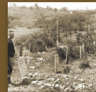
American war dead were interred in temporary graves on San Juan Hill after the fighting was over. They were transported to the United States in 1899.