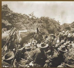
Soldiers of the 16th Infantry in San Juan Creek, under fire from the Spanish on San Juan Hill. July 1, 1898.