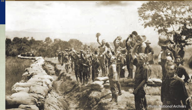
U.S. Army soldiers cheering upon hearing the news of the Spanish surrender of Santiago de Cuba, July 17, 1898.