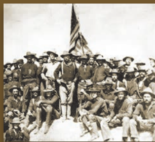
Lieutenant Colonel Theodore Roosevelt (center) and troopers of the 1st U.S. Volunteer Cavalry (The "Rough Riders") after the battle on Kettle Hill and San Juan Hill, July 1, 1898.