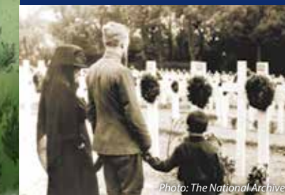
Americans pay their respects to the honored dead at Suresnes, 1919.

The deceased are buried in four plots. All repose equally in everlasting dignity. Twenty-four World War II unknowns are buried together in Plot D.