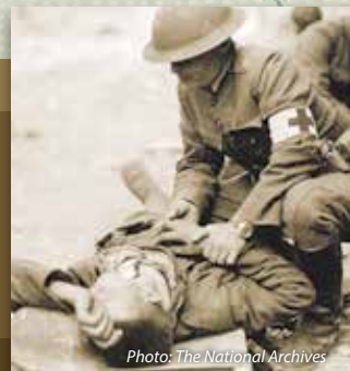
3rd Division surgeon examines casualty during the Aisne-Marne operation, July 22, 1918.