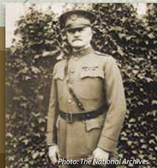
Gen. John J. Pershing, commander of the American Expeditionary Forces, at Chaumont, October 19, 1918.