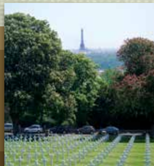
Paris is visible to the east of the Suresnes American Cemetery.