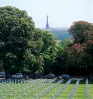
Paris is visible to the east of the Suresnes American Cemetery.