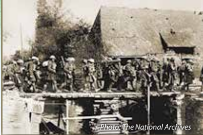
Soldiers of the 27th Division cross a temporary bridge at St. Souplet, Oct. 19, 1918.