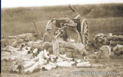
U.S. artillerymen fire 75mm gun toward Montsec from a position near Beaumont, September 12, 1918.