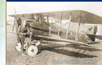
1st Lt. E. V. Rickenbacker, 94th "Hat in the Ring" Aero Squadron, after the St. Mihiel campaign.

The eagle sculpture at the cemetery's center serves as a sundial. General Pershing's statement, "Time Will Not Dim The Glory Of Their Deeds," is inscribed around its base.