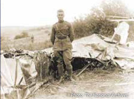
2nd Lt. Frank Luke, Jr. shot down 18 German planes and balloons in 17 days.