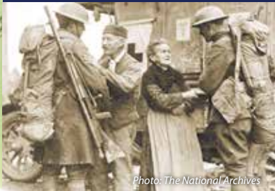
A French couple thanks U.S. soldiers who liberated their town on Nov. 6, 1918.

A Star of David marks headstones for those of the Jewish faith, and a Latin cross denotes all others. Headstones of Medal of Honor recipients are inscribed in gold.