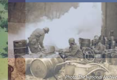
African-American soldiers lay a smoke screen to cover action over the Saar River.

At the cemetery's east end the ground rises to a knoll with the overlook. From it, one views the entire cemetery and the countryside for miles to the west.