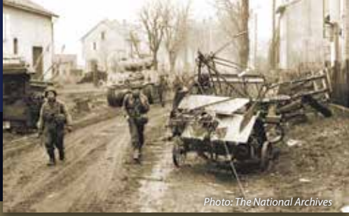
U.S. soldiers pursue German forces on the outskirts of Metz.