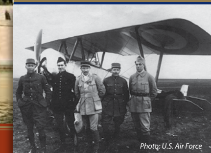
Pilots pose in front of a Nieuport XI fighter.

The base of the arch is engraved with dedicatory statements along with the names of pilots from the squadron, arranged by the date on which they joined. It includes their awards and date of death.