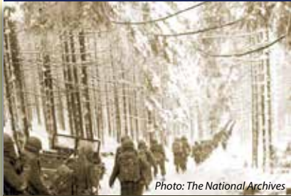
U.S. soldiers march to cut off the St. Vith-Houffalize road in Belgium.

The bronze statue of the Angel of Peace is bestowing the olive branch upon the heroic dead for whom he makes special commendation to the Almighty.