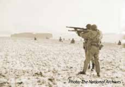
U.S. soldiers fire on German forces encircling Bastogne.