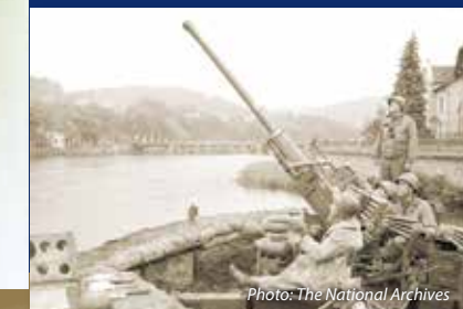
U.S. Army anti-aircraft gunners protect Epinal and the Moselle River from attacks by German aircraft.

The 5,255 graves are set in two fan shaped plots separated by a wide north-south mall lined with sycamore ( Platanus occidentalis ) trees.