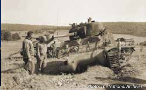
Soldiers view an M4 tank damaged by German gunfire southwest of Epinal, September 12, 1944.