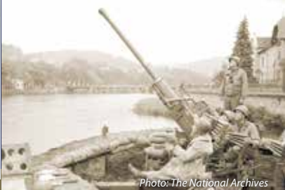
U.S. Army anti-aircraft gunners protect Epinal and the Moselle River from attacks by German aircraft.

The 5,255 graves are set in two fan shaped plots separated by a wide north-south mall lined with sycamore ( Platanus occidentalis ) trees.