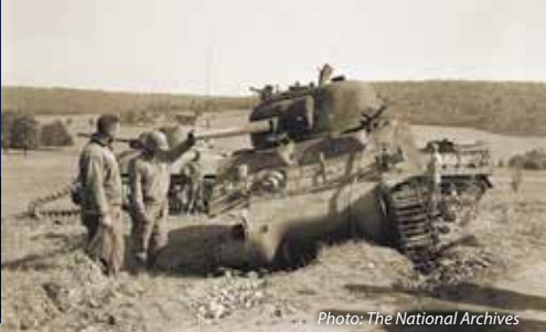
Soldiers view an M4 tank damaged by German gunfire southwest of Epinal, September 12, 1944.