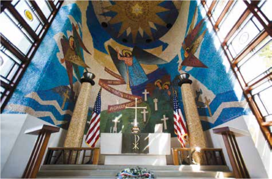
The deep blue of the ceiling above the altar denotes the depth of infinity.