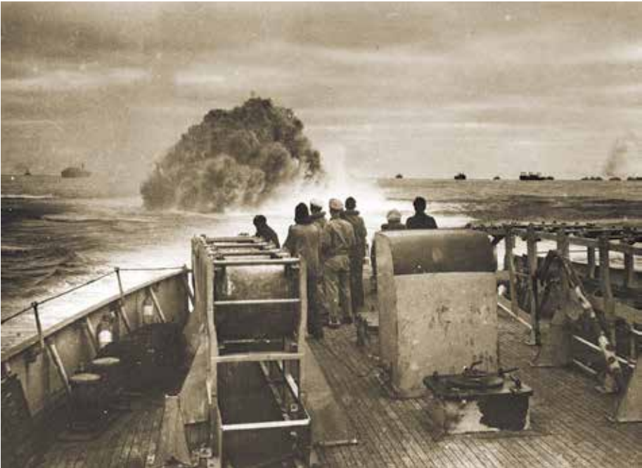
Coast Guardsmen of the U.S. Coast Guard Cutter Spencer watch the explosion of a depth charge blasting German submarine U 175 about to attack a convoy in the North Atlantic. April 17, 1943.

Through 1942 the balance poised precariously, with the Allies losing 800,000 tons