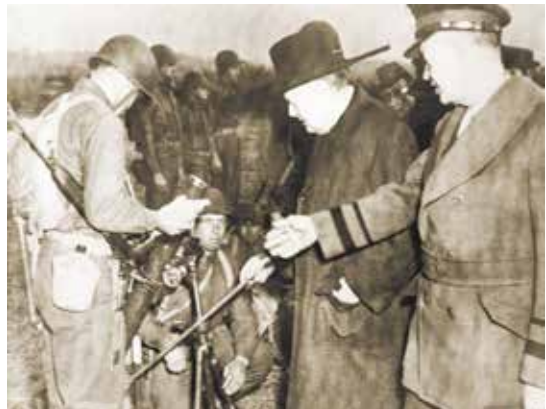
Prime Minister Winston Churchill and General Dwight D. Eisenhower inspect a mortar crew during a tour of an American Army base in England before D-Day, 1944.