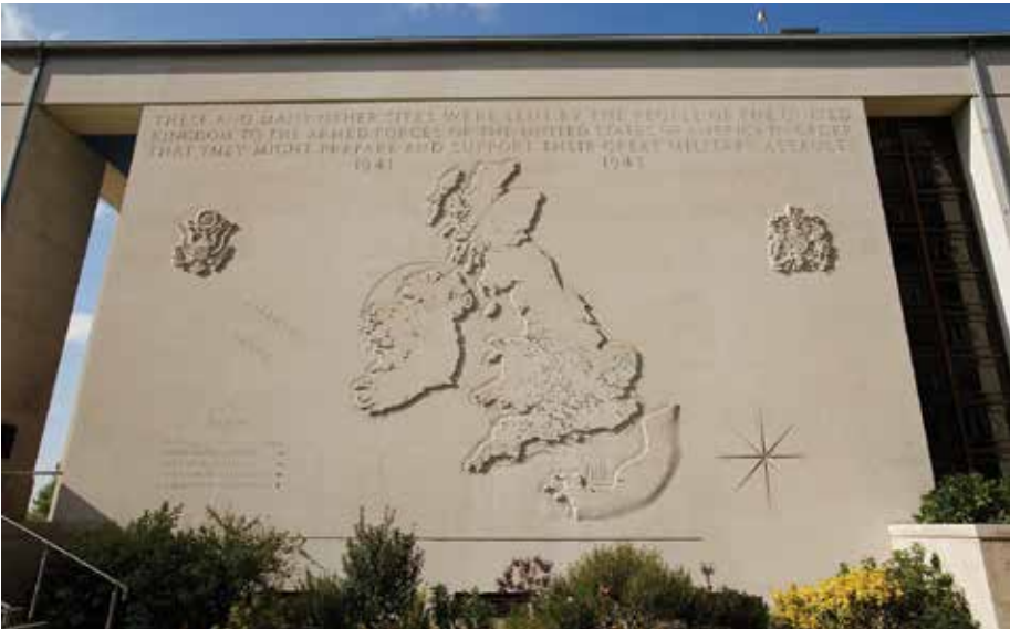
The map displays locations of American units in the United Kingdom during World War II.