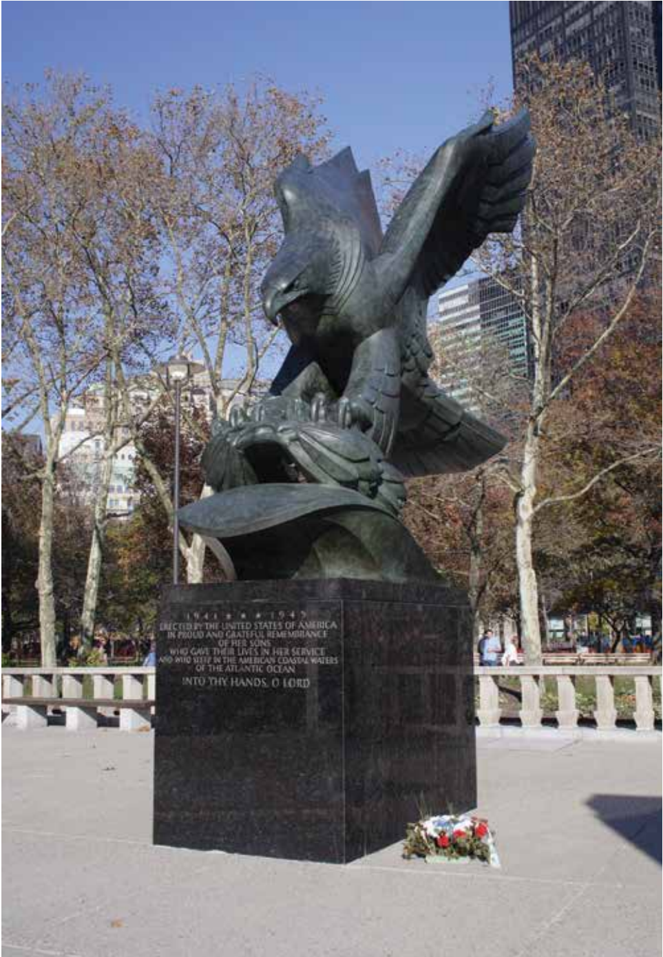
The eagle atop the base points southwest to the Statue of Liberty.