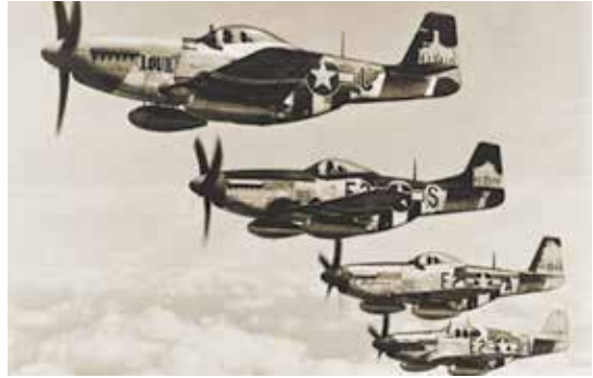
North American P-51 Mustangs of the 361st Fighter Group fly in formation over England in 1944.

American forces that had been building in England since mid-to-late 1942 were committed into Operation TORCH. American task forces landed on beaches flanking Casablanca, Morocco. Combined Anglo-American task forces similarly attacked Oran and Algiers, Algeria. Near Casablanca and Oran, resistance