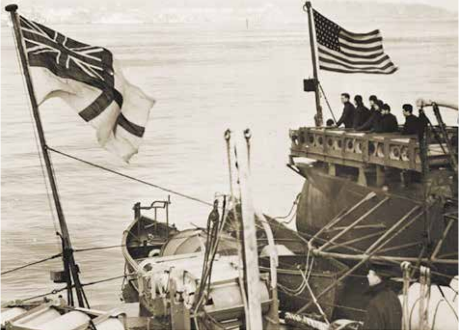
British and American warships lie alongside each other at the U.S. naval base in Londonderry, Ulster. The American warships had escorted a convoy across the Atlantic, and arrived at Londonderry in January 1942.

of shipping more than they replaced with new construction that year. In May 1943 the balance finally tipped decisively in favor of the Allies. In that month, increasingly effective Allied forces sank 41 of 240 German U-Boats, while losing fewer than 300,000 tons of shipping to them.