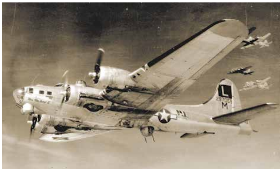
The B-17G Flying Fortress “Mon Tete Rouge II,” and other bombers of the 452nd Bomb Group, flying on a mission to bomb German targets in France on March 28, 1944.

Deep American daylight raids, such as one on Schweinfurt on October 14, 1943, proved prohibitively costly until the Americans perfected a long-range fighter to escort their bombers to distant targets. This capability was achieved in December 1943 with the P-51 Mustang, upgraded for a considerably greater range. Lieutenant Colonel Thomas Hitchcock, Jr. of the U.S. Army Air Forces participated as a pilot in the improvement