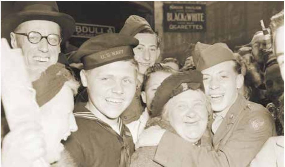
American servicemen and British civilians in London celebrate Germany's surrender. May 8, 1945.