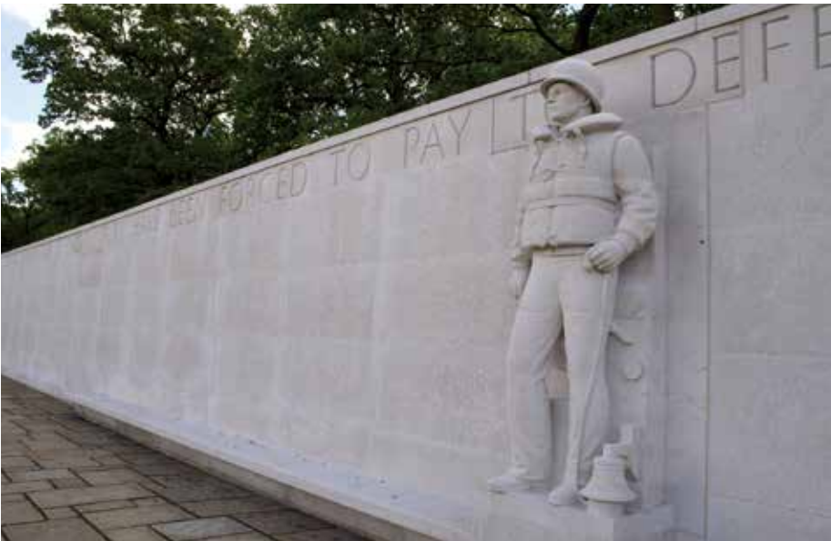
The statue of a Coast Guardsman is one of four standing watch over the Wall of the Missing.