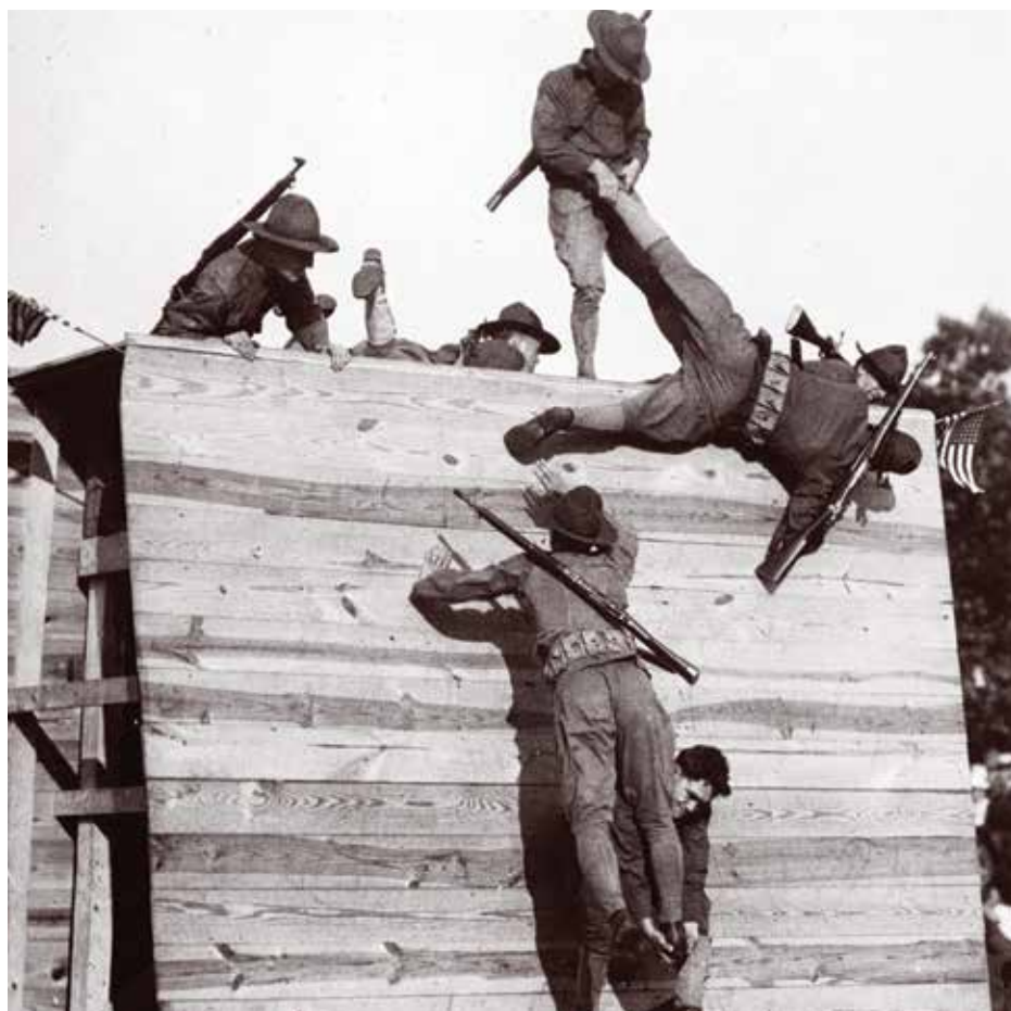
Soldiers scaling a wall during training at Camp Wadsworth, SC, in 1918.

The United States was unprepared for war. At the time, the major combatants were fielding armies comprised of millions of soldiers; the U.S. Army numbered less than 130,000. While the U.S. Navy could deploy a modern fleet relatively quickly, it was ill-equipped for anti-submarine warfare. To raise a national army Congress passed the Selective Service Act in May 1917, which instituted a system for conscripting men into military service.