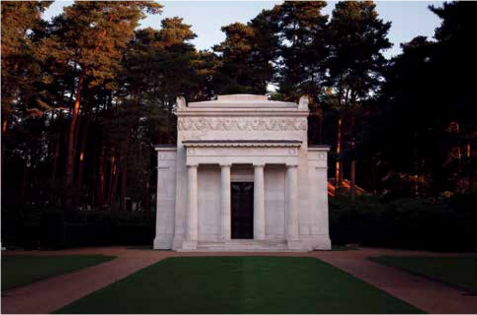
The chapel.