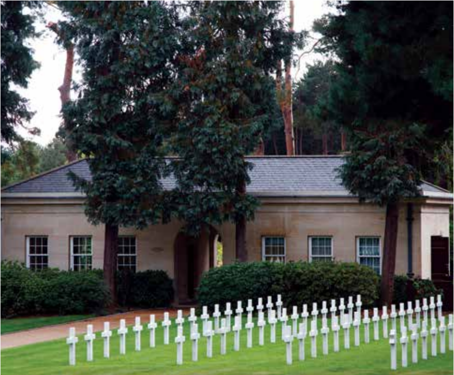
Visitor building.