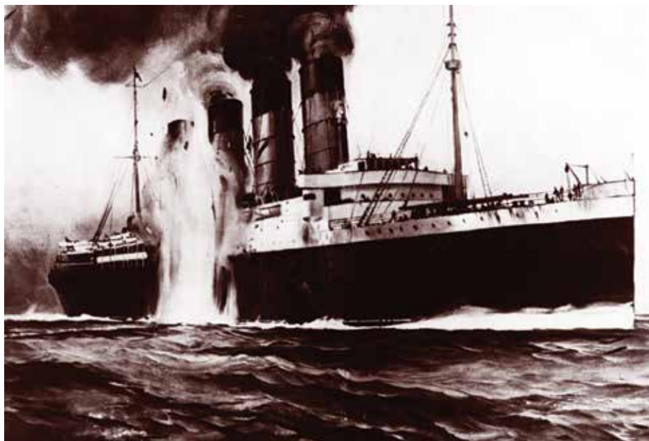
A drawing made for the New York Herald depicts Lusitania as it is hit by a torpedo.

As the war progressed, American popular opinion increasingly favored the Allies. By fall of 1914, the prospect of a long, drawn-out conflict led the British Navy to blockade the North Sea and deny trade from entering German ports. Unable to secure the use of the sea for themselves, Germany responded by using submarines to attack Allied and neutral merchant ships, in an attempt to cut off the United Kingdom from supplies and military aid. On May 7, 1915 a German U-boat torpedo sank the RMS Lusitania , which was carrying both civilian passengers and munitions, off the coast of Ireland. The Lusitania disaster took the lives of 1,198 of her passengers and crew, including 128 Americans, provoking outrage in the United States. Submarine sinkings were particularly disturbing, as they came without notice and submarines had neither means nor incentive to rescue passengers or crew. A week after the Lusitania sinking, President Woodrow Wilson declared that the United States was “too proud to fight” and would not enter the war. Germany dramatically restricted submarine operations to avoid further provoking the Americans.