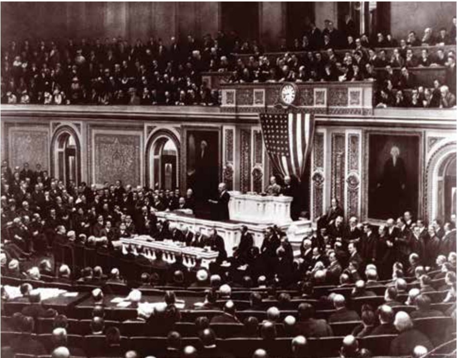
President Wilson's address to Congress, requesting a declaration of war on Germany.

This change in German military policy coincided with a significant diplomatic misstep. In January, British Intelligence intercepted and decoded a telegram dispatched by German Foreign Secretary Arthur Zimmermann to the German Ambassador in Mexico City. In the message, Zimmermann instructed the ambassador that if the United States entered the war, he was to approach the Mexican Government with a proposal for a military alliance. If the Mexicans accepted, the Germans proposed to help them regain territory lost to the United States in the 19 th century, lands which became the states of Texas, New Mexico, and Arizona.