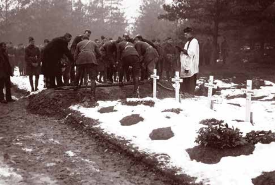
American burial at Brookwood Cemetery, 1919.

During World War II, Brookwood American Cemetery was the only permanent American cemetery in Europe that was continuously operated with institutional oversight. The remaining cemeteries, located in France and Belgium, were evacuated by American ABMC personnel in 1940, prior to the German invasion and subsequent occupation of Western Europe.