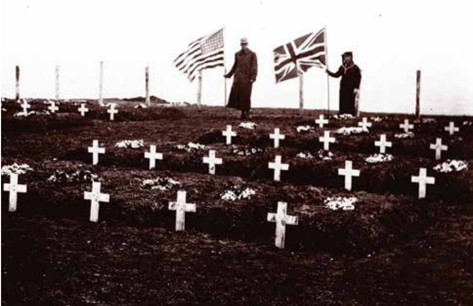
Temporary cemetery in Islay, Scotland, with the interments of those who died in the sinking of the SS Tuscania .