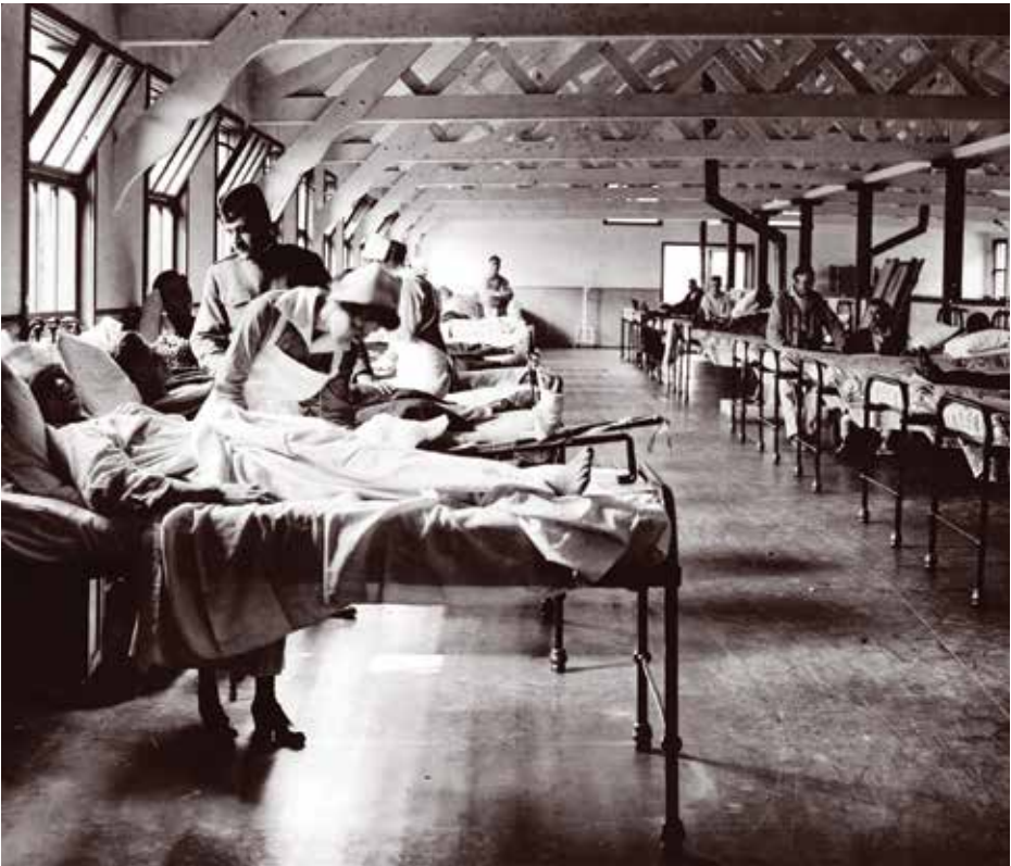
American Red Cross hospital in Liverpool, England, 1918.

In early 1918, an influenza outbreak swept through military bases in the United States. The virus was an exceptionally deadly strain that struck young, previously healthy adults particularly hard. Once their bodies were weakened, many were vulnerable to secondary infections such as pneumonia, often leading to death. By the late spring, there were influenza outbreaks in 14 of the largest Army training camps in the United States.