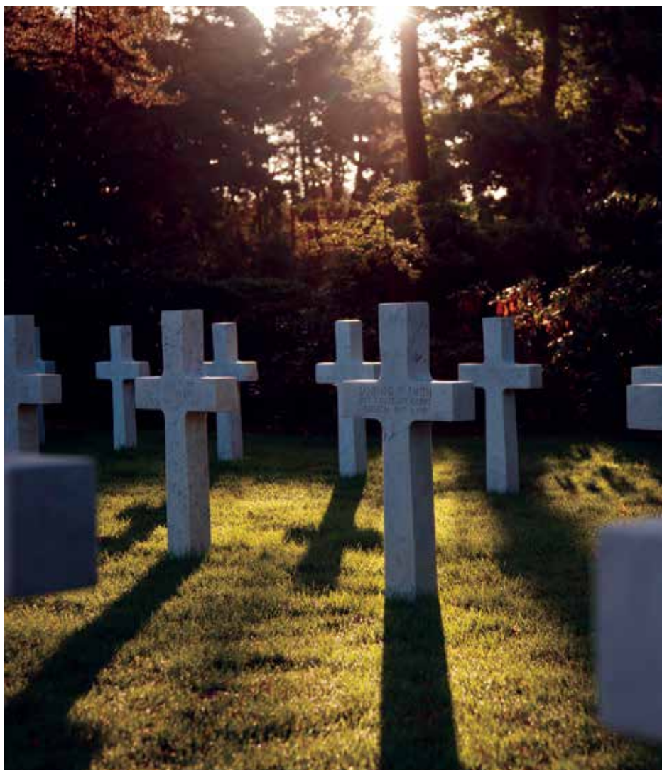
Headstones at Brookwood American Cemetery.