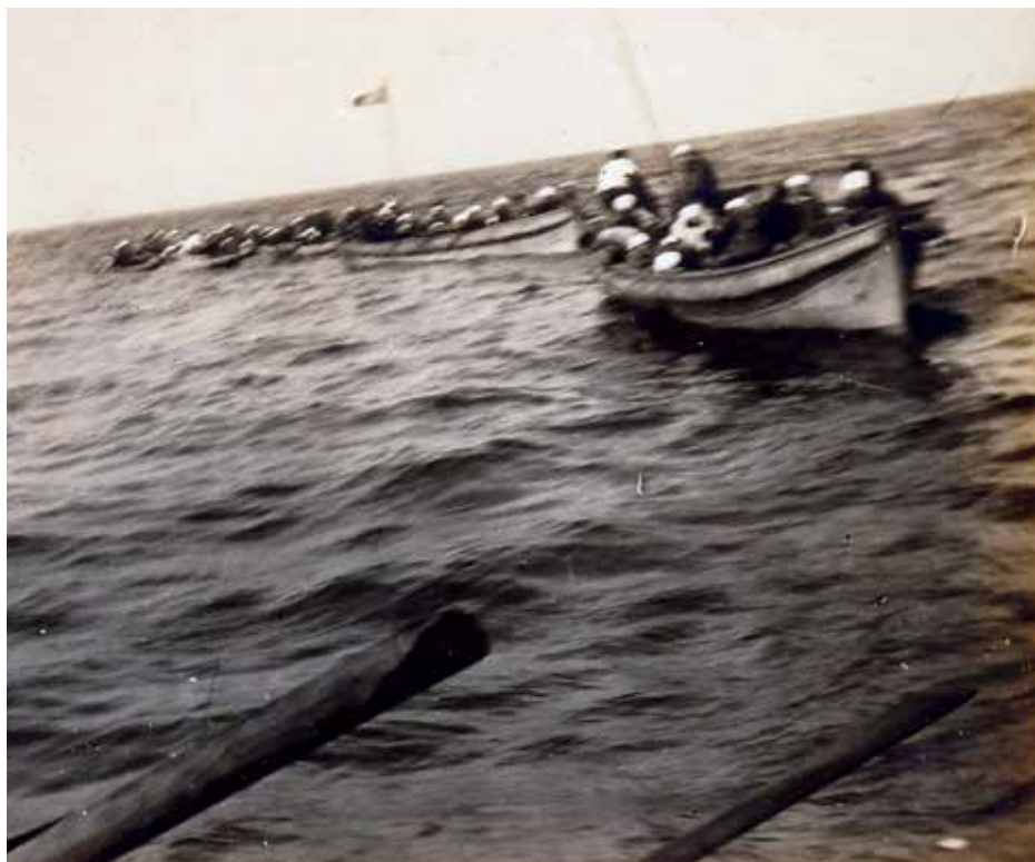
Survivors of the USS President Lincoln in lifeboats off the coast of Brest, France, 1918.

Troopships also faced dangers from accidents. On October 6, 1918, while leading a convoy, the HMS Otranto —a Royal Navy vessel serving as a troopship for American soldiers—was accidentally rammed by another vessel in rough seas near Islay. Severely damaged, the Otranto drifted for a short time before it smashed into the rocky coastline and sank. Many of those on board were saved, but over 460 perished in the disaster, including more than 350 Americans.