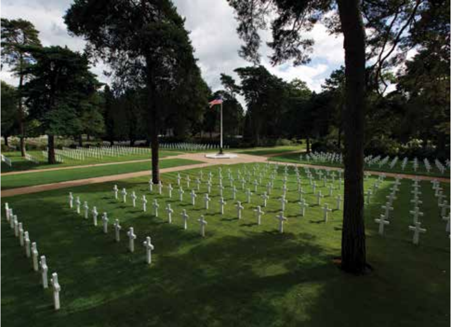
Burial sections, with the American flag in the background.

THE WORLD MUST BE MADE SAFE FOR DEMOCRACY. ITS PEACE MUST BE PLANTED UPON THE TESTED FOUNDATIONS OF POLITICAL LIBERTY. WE HAVE NO SELFISH ENDS TO SERVE. WE DESIRE NO CONQUEST, NO DOMINION. WE SEEK NO INDEMNITIES FOR OURSELVES, NO MATERIAL COMPENSATION FOR THE SACRIFICES WE SHALL FREELY MAKE. WE ARE BUT ONE OF THE CHAMPIONS OF THE RIGHTS OF MANKIND. WE SHALL BE SATISFIED WHEN THOSE RIGHTS HAVE BEEN MADE AS SECURE AS THE FAITH AND THE FREEDOM OF NATIONS CAN MAKE THEM.