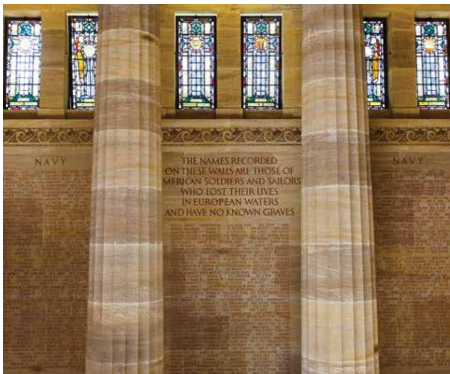
Chapel interior and the Walls of the Missing.