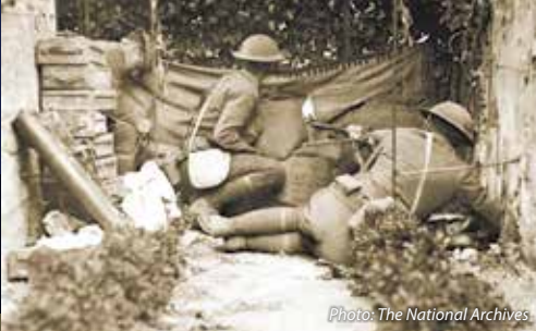
7th Machine Gun Battalion, 3rd Division, guarding the Marne against German attacks.