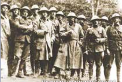
Surviving officers of 2nd Battalion, 6th Marine Regiment, at Belleau Wood, June 18, 1918.

Here you can meet our staff, get your questions answered, and sign the guest register.